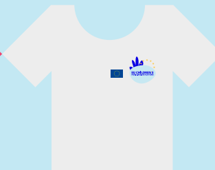
Adults accompanying children