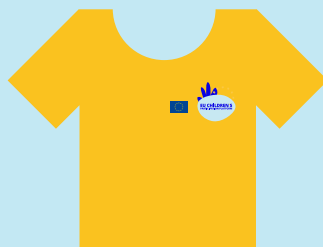
European Commission represented by the Directorate-General of Justice and Consumers team